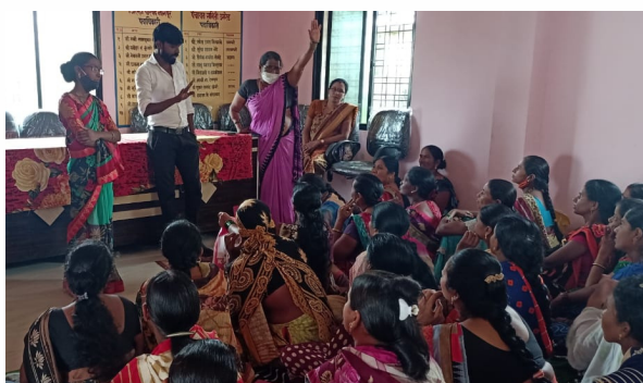
3 Women Special Gram Sabha

The community engages themselves in common development programs and take ownership in local self-government. Established strong network to access their right for their empowerment & ensuring their participation in decision making for development.