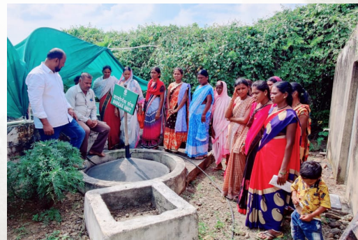
Farmers Exposure Visit