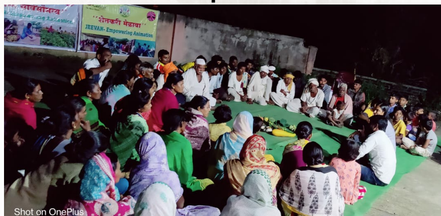
Village Level Farmers Melava