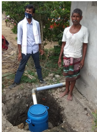
183 Soak pits constructed in 15 villages

After JEEVAN team facilitation more 53 community issues resolved by Community-based Movement.