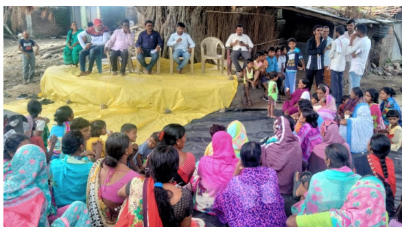
Special Ward Sabha to resolve Drinking water issue.