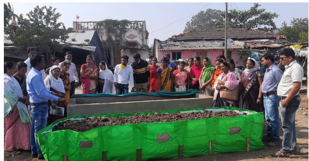
Demonstration to the Farmers on vermicompost making

NMSSS is implemented Project JEEVAN since 2016, JEEVAN-Empowering Animation is a second phase of JEEVAN-PLE project, Empowering Animation is "A liberating action emerging from the critical reflection of communities that is self-propelling, self-directing, continuous and collective aimed at the humanization of communities and persons and helping them become subjects of transformation than objects." NMSSS is implemented this project from the last 6 years in the 15 villages of Umred block at Nagpur District and focused on 5879 population to overall development of the Women and Farmers in the area of Good Governance and Sustainable agriculture.