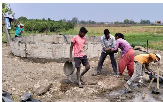
13 Well constructed