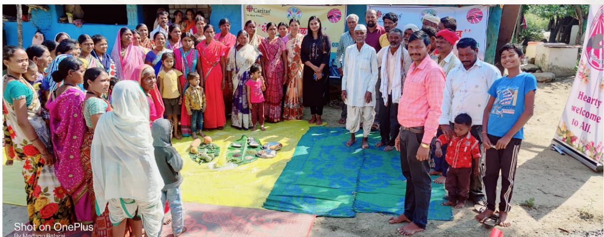
Farmers Agriculture field visit to see the results of organic fertilizers