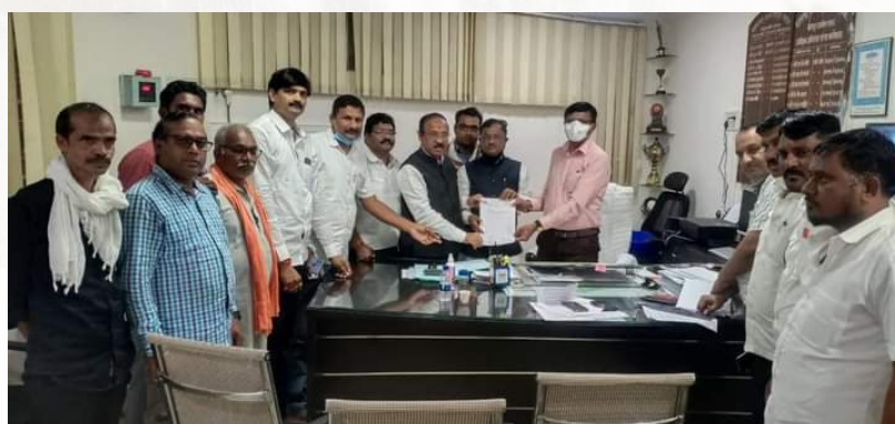
Community visited to the MLA & BDO to resolved villages Water and Transportation issue

After JEEVAN team facilitation more 53 community issues resolved by Community-based Movement.